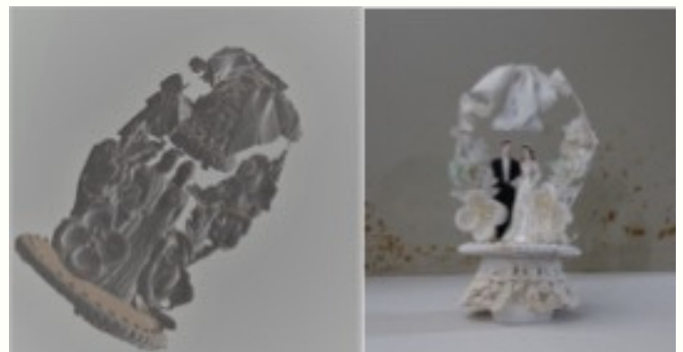
Side by Side Comparison – 3D Scan vs Object

While we are several steps away from creating the first online exhibit using 3D scans, we have begun the journey. The scanning equipment was purchased using the Duff McDuff Green, Jr. Fund grant funds supplied by the Community Foundation of the Rappahannock River Region ( https://www.cfrrr.org/ ).