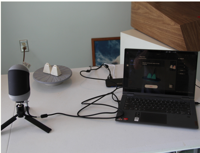
Equipment Used – Mole 3D Scanner and Turntable by 3dMakerPro