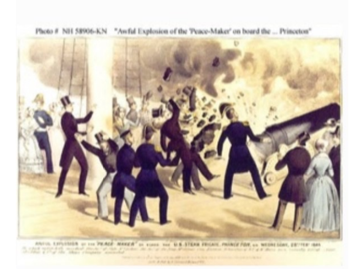
Snippets from the new feature.